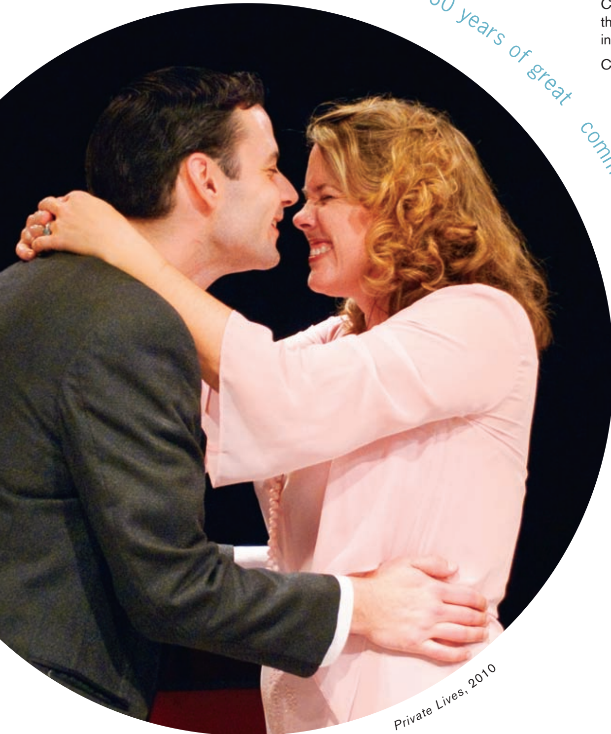
Private Lives, 2010

community theatre ... HAVE YOU HEARD...?