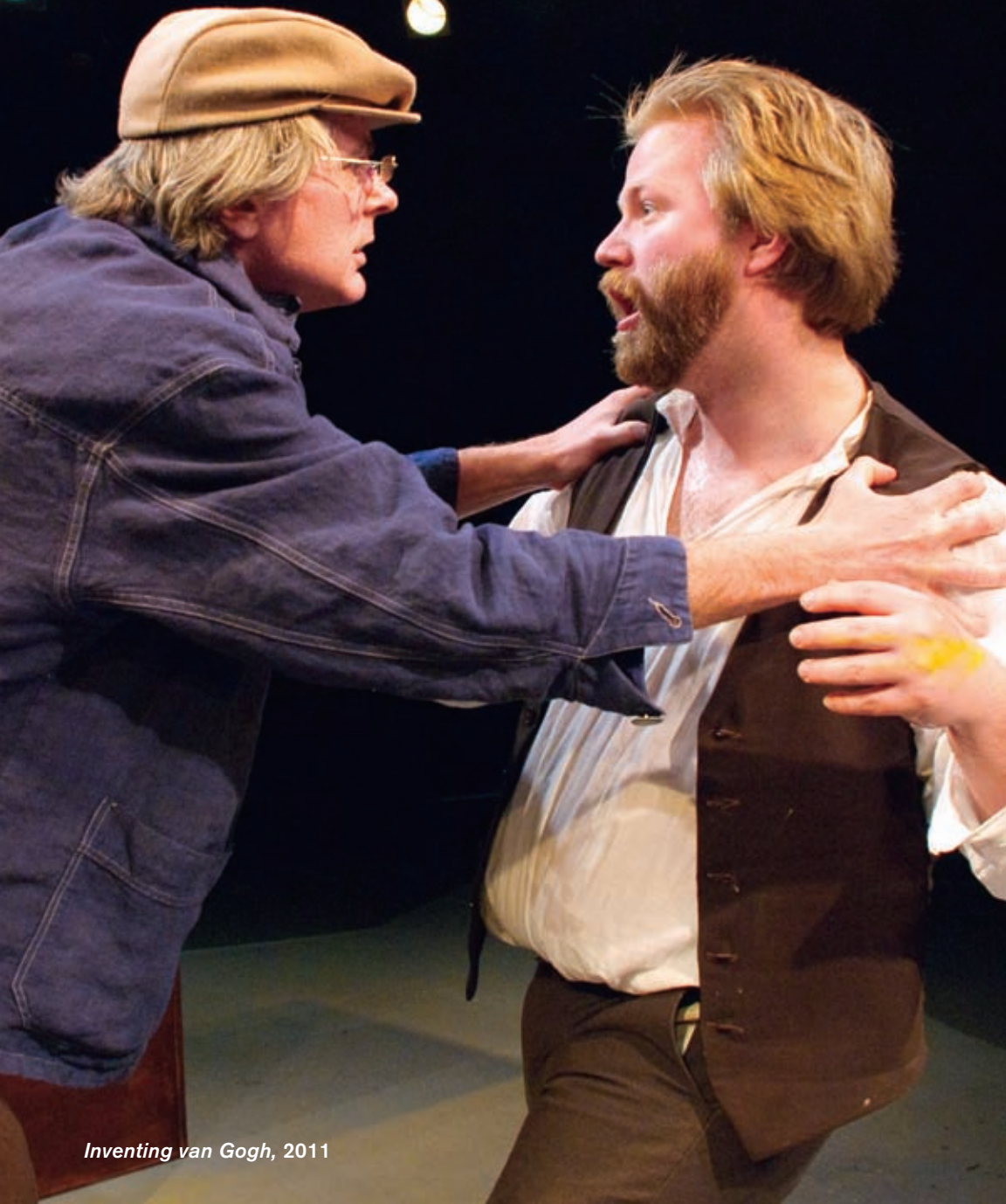
Inventing van Gogh, 2011