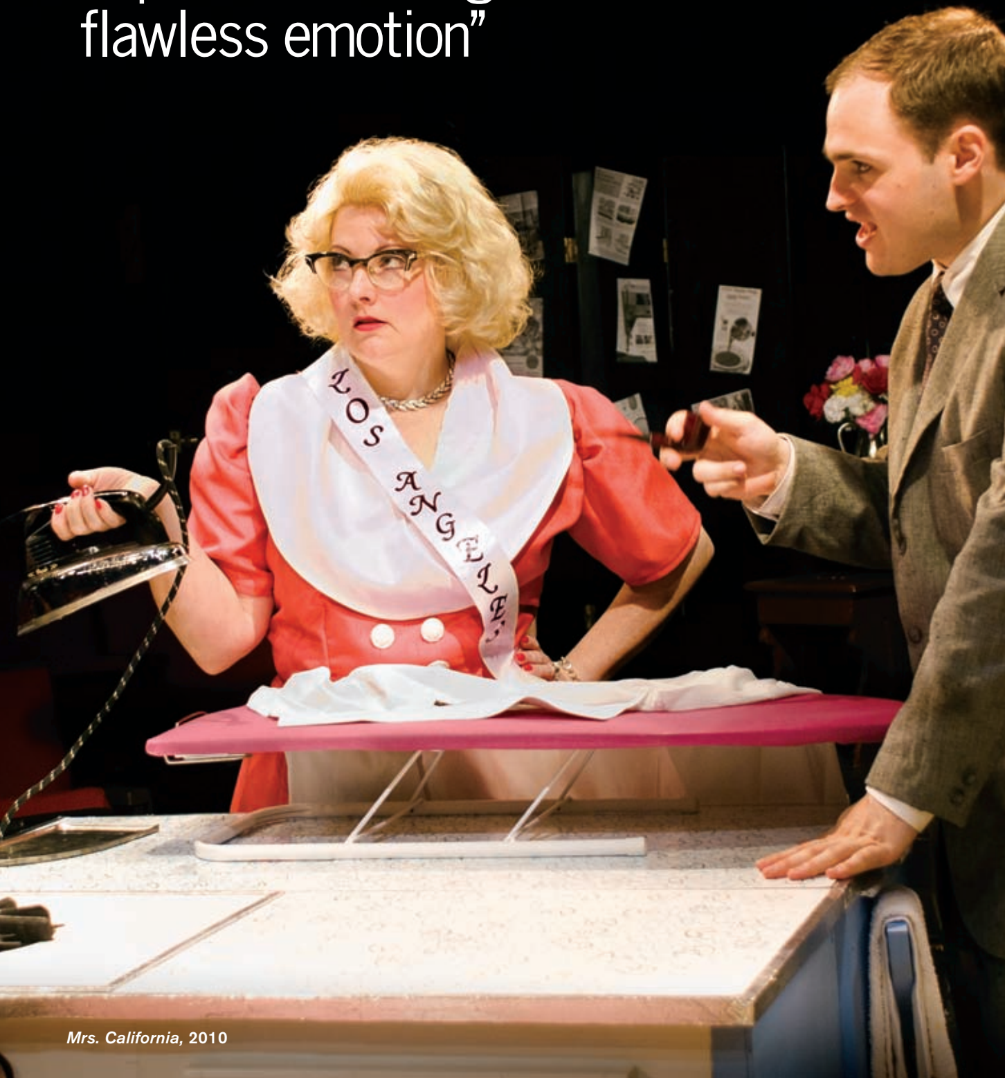
Mrs. California, 2010

“impeccable timing and flawless emotion”